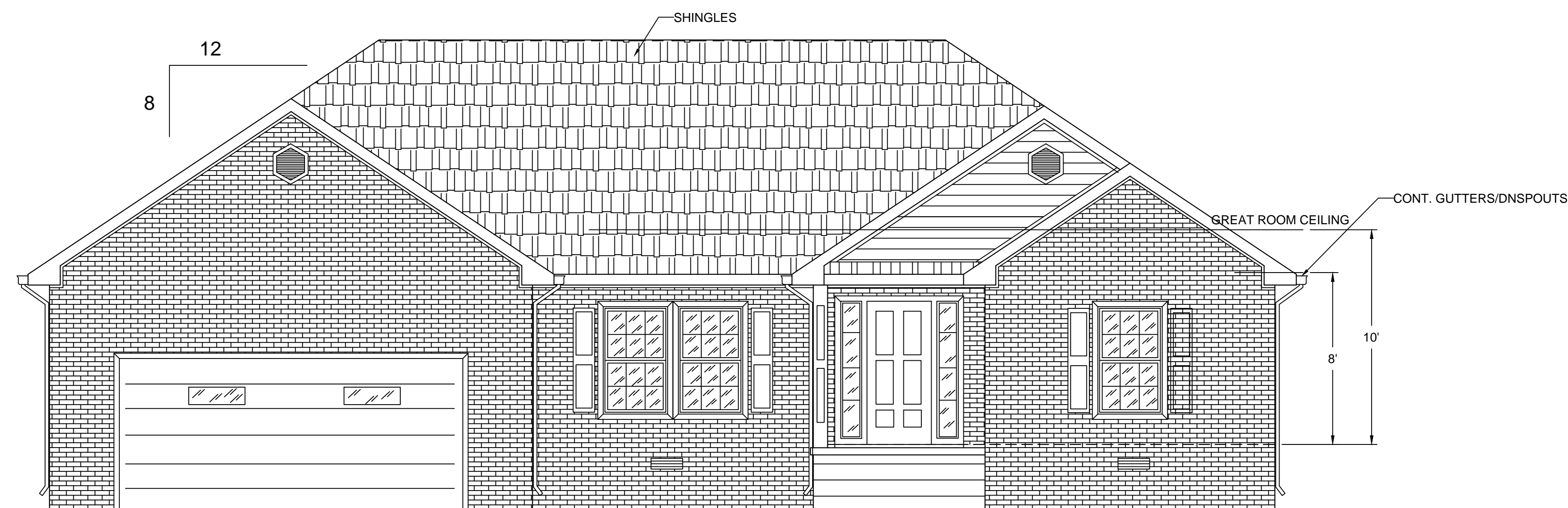
FRONT ELEVATION SCALE 1/4"=1'-0"

This service not being an architectural firm stands no liability for structural or architectural design integrity. Every effort has been made to ensure all dim. are correct and governmental regulations have been met. If an error or omission does occur, it is the sole responsibility of the contractor/owner to correct the error/omission at his own expense and not of this drafting service.